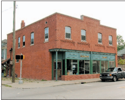
Victory Inner-City Ministries has high hopes for its furniture shop and art gallery.