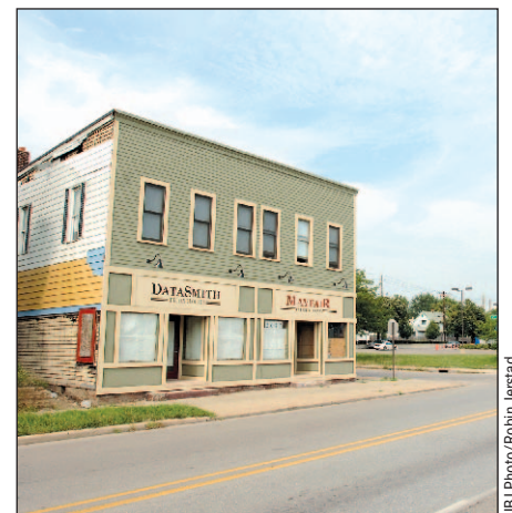
A former biker bar has been remodeled into the home of two new businesses.

"If we didn't have faith in the area, we'd pack up our marbles and move elsewhere," Britain said.